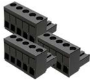
BX-RTB08 (Kit - 3 pieces)