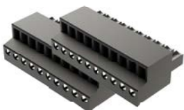
BX-RTB10-2 (Kit - 2 pieces)