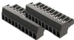
BX-RTB10 (Kit - 2 pieces)