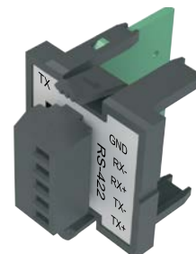
Removable Connector Included

PLCs via K-Sequence protocol, as well as devices that send or receive non-sequenced ASCII strings or characters.