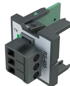
Removable Connector Included