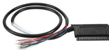
ZIPLink Pigtail Cable