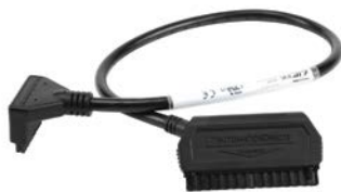
Pre-wired ZIPLink Cable