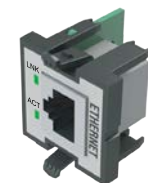
BX-P-ECOMEX Ethernet Port