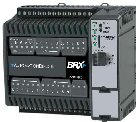
BX 18 Micro PLC Unit (MPU) (No Built-in Analog or Ethernet port)