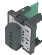
BX-P-SER422-TERM RS-422 Port