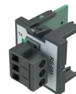
BX-P-SER4-TERM RS-485 Port