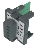
BX-P-SER2-TERMFC RS-232 Port w/ Flow Control