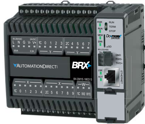
BRX 18E Micro PLC Unit (MPU) (Built-in Analog and Ethernet port)