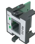
BX-P-SER2-RJ12 RS-232 Port (RJ12)