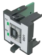
BX-P-USB-B USB Type B Port