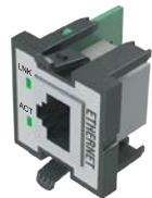
BX-P-ECOMLT Ethernet Port (RJ45)