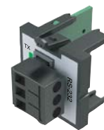
BX-P-SER2-TERM RS-232 Port

NOTE: Pluggable Option Modules cannot be installed in BRX Remote I/O modules (e.g., BX-DMIO, BX-MBIO, BX-EBC100).