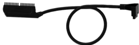
Pre-wired ZIPLink Cable

your wiring time and cost. The pigtail cable is 1 meter in length.