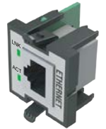
BX-P-ECOMLT Ethernet Port (RJ45)