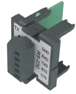
BX-P-SER2-TERMFC RS-232 Port w/ Flow Control