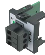
BX-P-SER2-TERM RS-232 Port

NOTE: Pluggable Option Modules cannot be installed in BRX Remote I/O modules (e.g., BX-DMIO, BX-MBIO, BX-EBC100).