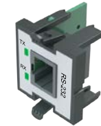
BX-P-SER2-RJ12 RS-232 Port (RJ12)