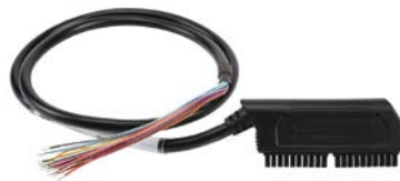
ZIPLink Pigtail Cable