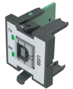
BX-P-USB-B USB Type B Port