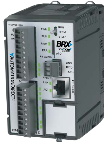
BX 10E Micro PLC Unit (MPU) (Built-in Analog and Ethernet port)