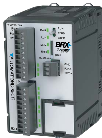
BX 10 Micro PLC Unit (MPU) (No Built-in Analog or Ethernet port)