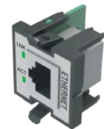
BX-P-ECOMEX Ethernet Port