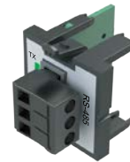
BX-P-SER4-TERM RS-485 Port