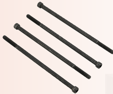
Part No. 51020070044