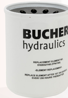
Part No. 51020321165