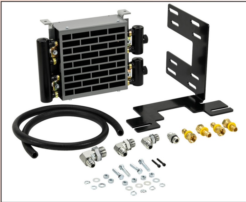
Part No. 51024420101

These heat exchangers are designed specifically to fit the Bucher HPUs to reduce heat buildup during higher duty cycles. Bracket and hardware included for mounting to TEFC motor. By maintaining a lower oil temperature, hydraulic fluid lasts longer and components work more effectively, having a higher life expectancy.