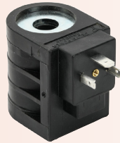
Part No. 51020191424