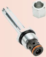
Part No. 51020850999

Bucher HPU Accessories include coils, replacement fluid filters, and unloader valve. The unloader valve 51020850999 is required to be installed in the manifold when using center closed or center float control valves. Refer to the manual for installation instructions.