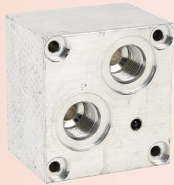
Part No. 510204910200

Mounting accessories include directional valve adapters to allow mounting of D03 valves to the T5 and T6 series units and D05 valves to the Hi-Lo unit.