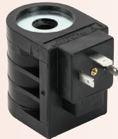
Part No. 51020191424