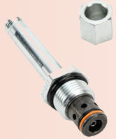
Part No. 51020850999

Bucher HPU Accessories include coils, replacement fluid filters, and unloader valve. The unloader valve 51020850999 is required to be installed in the manifold when using center closed or center float control valves. Refer to the manual for installation instructions.