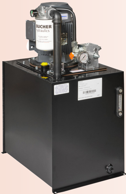
Part No. 51060920005