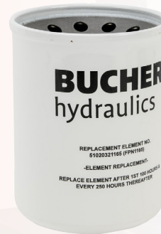
Part No. 51020321165