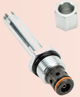
Part No. 51020850999

Bucher HPU Accessories include coils, replacement fluid filters, and unloader valve. The unloader valve 51020850999 is required to be installed in the manifold when using center closed or center float control valves. Refer to the manual for installation instructions.