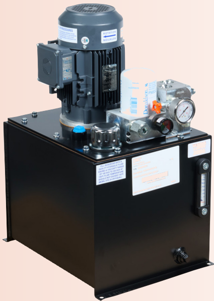
Part No. 51060550015