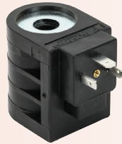
Part No. 51020191424