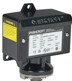
Part No. B424B30IMV

The Ashcroft B-Series pressure switch offers precision and reliability in the toughest industrial applications. Designed with a NEMA 4X rating, this switch stands up to harsh environments, resisting water, dust, and corrosion, which makes it perfect for industrial, process, and outdoor applications. Featuring Ashcroft's renowned accuracy, an easily adjustable setpoint, and a durable, compact build, the B-Series delivers reliable and consistent performance.