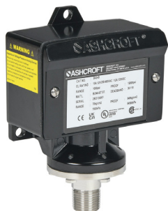
Part No. B424B1000