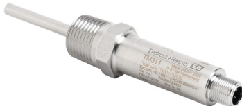
Part No. TM311-TLR0/0