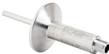
Part No. TM311-TLR0/0 / TM311-TLV1/0

The Endress+Hauser TM311 iTHERM® CompactLine conveniently combines a precision RTD sensing element and transmitter electronics in a single stainless steel temperature transmitter probe. Preconfigured for a process measuring range of 0 to +150 °C (32 to +302 °F), the TM311 can be used for a wide variety of temperature sensing applications. Several probe insertion lengths are available, and process connections include male NPT thread or 3-A approved sanitary clean in place tri-clamp. An M12 quick-disconnect provides electrical connection and can be connected to operate as a loop powered 4-20 mA output signal or with IO-Link communications that enable access to various temperature process variable, configuration, diagnostic, and logging parameters.