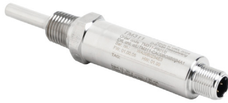
Part No. TM311-P801/0