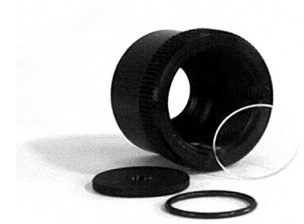
Dimensions mm [inches]