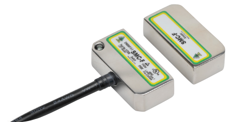
Stainless Steel for Food