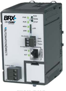
BX-DM1E-M-D 12-24 VDC