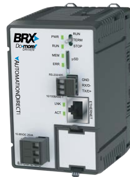
BX-DM1E-M-D 12–24 VDC