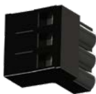
Removable Connector Included ADC Part # BX-RTB03