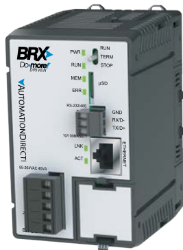
BX-DM1E-M 120–240 VAC

The units have no built-in I/O points. This allows use as a standalone controller unit with no I/O or you can customize the I/O to meet the needs of your application by adding BRX Expansion Modules. All BX ME MPUs can expand their capacity with the addition of as many as eight (8) BRX Expansion Modules, allowing more flexibility while keeping control cost down.