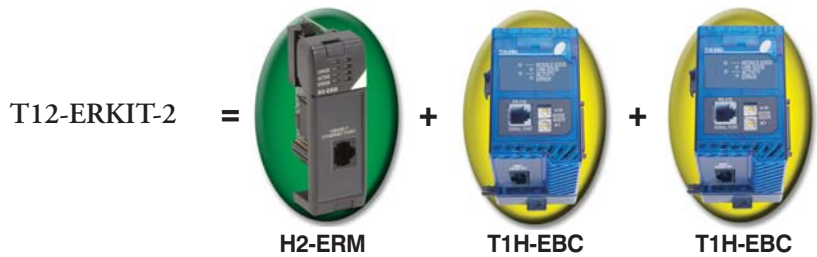
Example kit: T12-ERKIT-2 includes one H2-ERM and two T1H-EBCs.