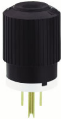
Straight Blade Plug.