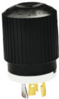
Locking Male Plug.