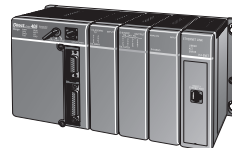
DL405 CPUs Two built-in ports D4-430/D4-440; max. baud = 19.2 K Four built-in ports D4-450/D4-454; max. baud = 38.4 K