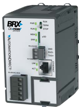
BX-DM1E-M 120–240 VAC

The units have no built-in I/O points. This allows use as a standalone controller unit with no I/O or you can customize the I/O to meet the needs of your application by adding BRX Expansion Modules. All BX ME MPUs can expand their capacity with the addition of as many as eight (8) BRX Expansion Modules, allowing more flexibility while keeping control cost down.