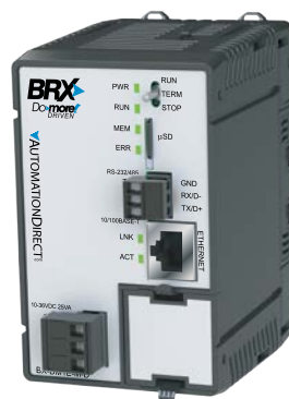
BX-DM1E-M-D 12–24 VDC